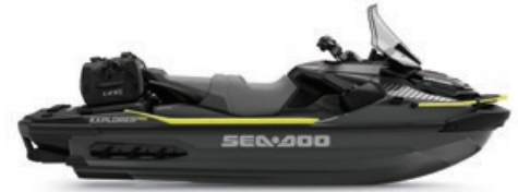
● Iceland Grey